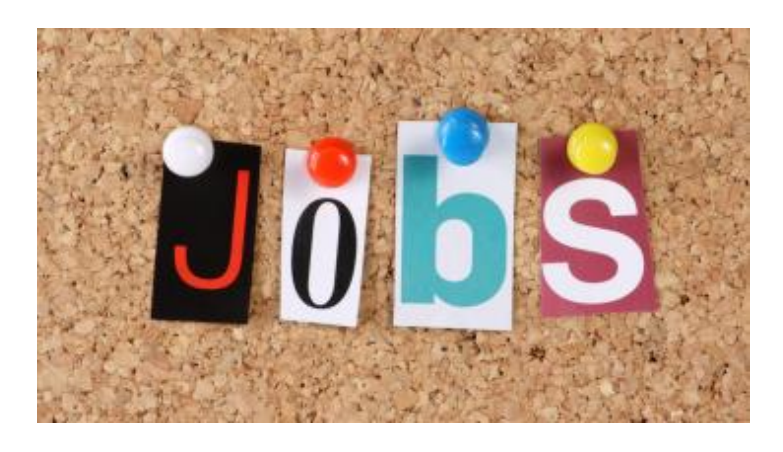
Job Opportunities at Kansas Legal Services