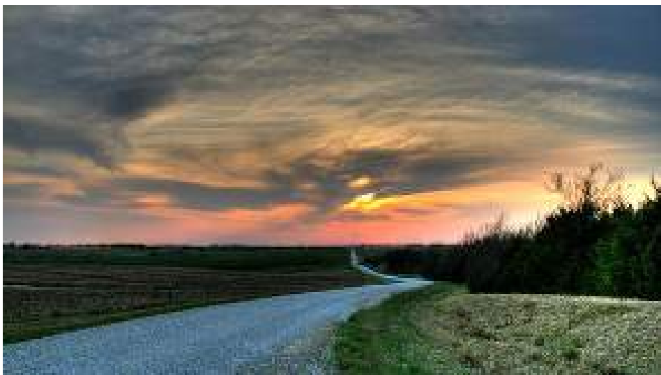
STAFF PHOTOGRAPHY Western Douglas County

How do people access mediation services? KLS provides mediation in a wide variety of cases including employment, insurance, housing and public accommodations discrimination matters, special education, and domestic matters such as custody and visitation. Kansans received free mediation assistance from KLS, which receives referrals from local district courts, the Kansas Human Rights Commission, the Kansas State Department of Education, and others. KLS also offers fee-based mediation on a sliding scale.