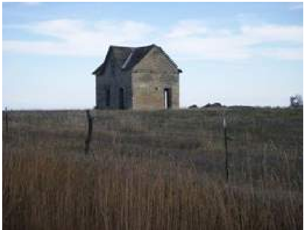
PRAIRIE LIFE Greetings from Kansas

Victims of Crime Act Grants (VOCA) are administered by the Governor's Grants Office to assist victims of domestic violence, sexual assault, and other crimes.