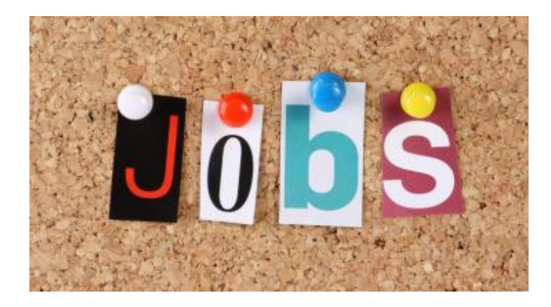
Job Opportunities at Kansas Legal Services