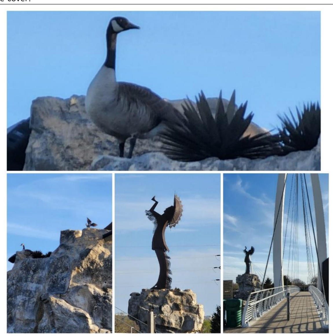
The Keeper of the Plains is a 44 foot tall sculpture standing at the point where the Big and Little Arkansas rivers meet. The two rivers are sacred ground to the Native American people.

Throughout this annual report, you will see photos that were contributed to the contest by staff, staff spouses and staff children. Staff was asked to contribute photos of Kansas or photos relating to the pandemic. You can see it was a difficult choice to pick just one for the cover!