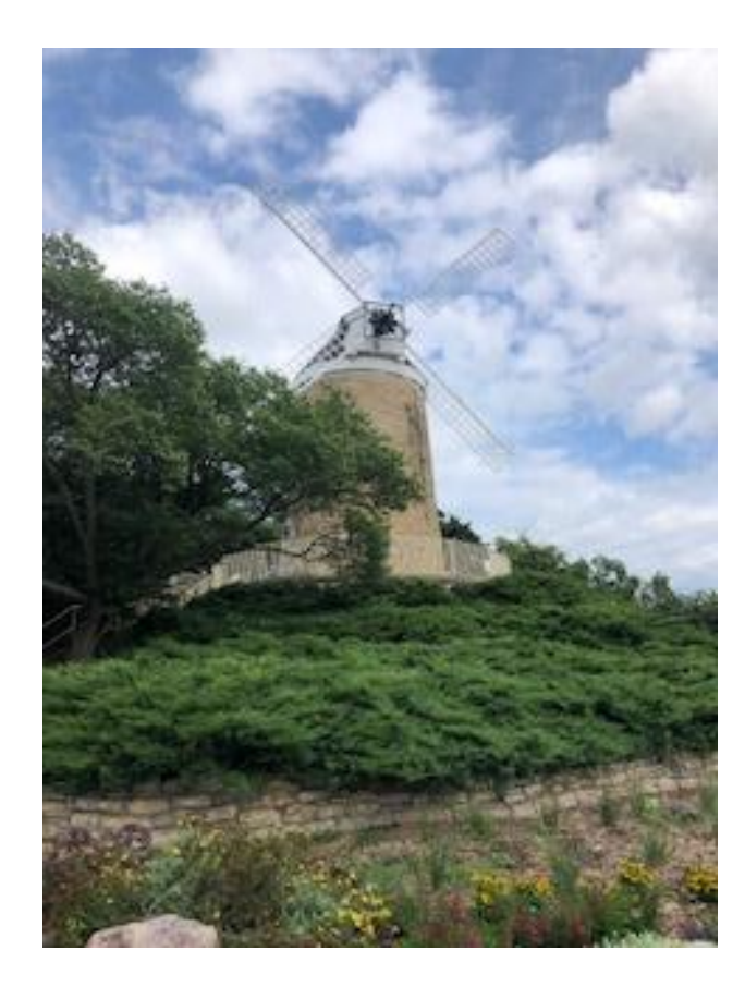
Photo of a windmill in Wamego